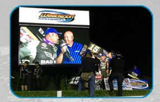
PortVision HD Video Display