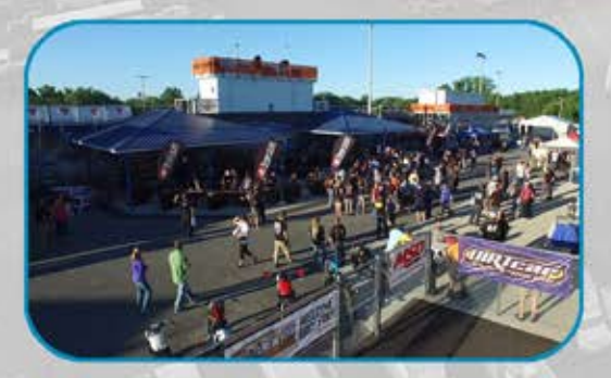
NEW Beer Garden